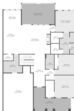
Created By Pinhandle Productions - Sizes And Dimensions Are Approximate, Actual May Vary.