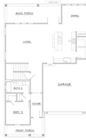
LOWER LEVEL FLOOR PLAN